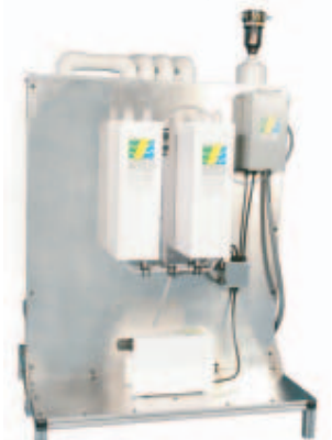
Front of PZ2-8 on Optional Skid Mount Upgrade