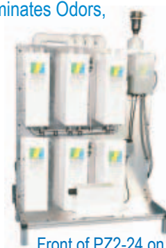
Front of PZ2-24 on Skid Mount