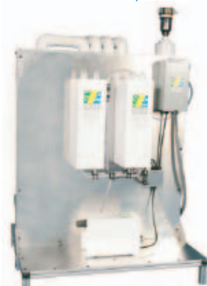
Front of PZ2-6 on Optional Skid Mount Upgrade